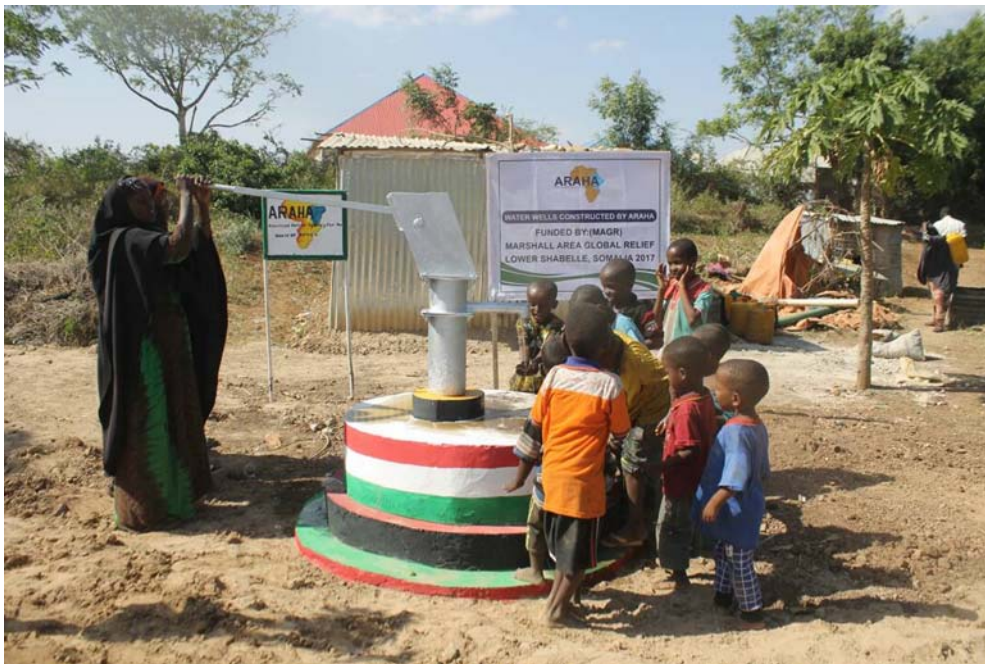
One of four wells constructed in the Lower Shabelle regions Somalia.